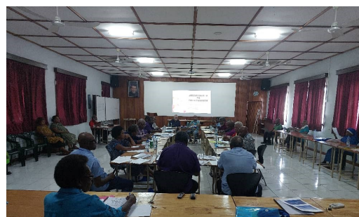
Left picture shows PC members during morning service at DBTI Emmaus Chapel. Right picture is during PC meeting .

The Covid 19 pandemic from 2019 – 2021 has impacted the church activities both positively and negatively. The Provincial Council (PC) meeting could not be held since 2018, however, the Provincial Council was successfully held this year in the month of November 2022.