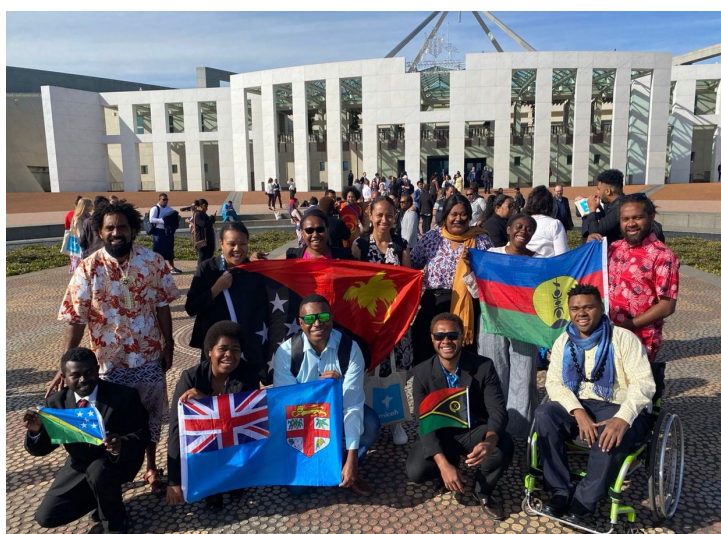
Young Leaders from e Pasifika who attended the Summit