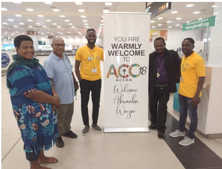
Anglican Church of PNG (ACPNG) & Anglican Church of Melanesia (ACOM), representatives to ACC 18 were being welcomed by youths at Ghana International Airport.