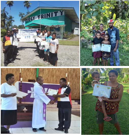
Parents receiving their certificates both in Madang and Aiome.