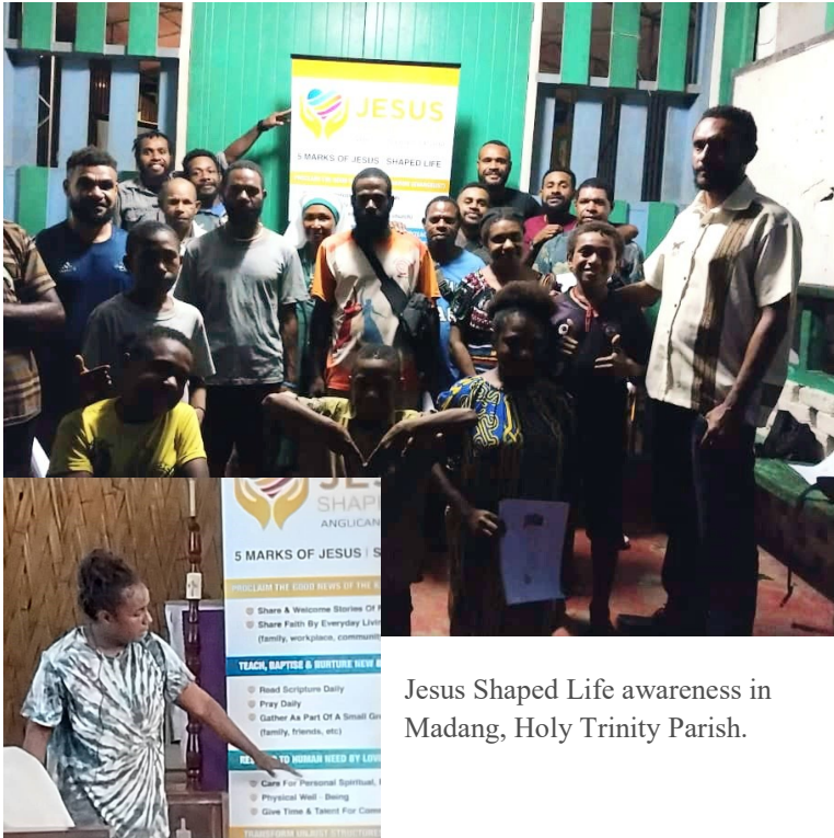
Jesus Shaped Life awareness in Madang, Holy Trinity Parish.