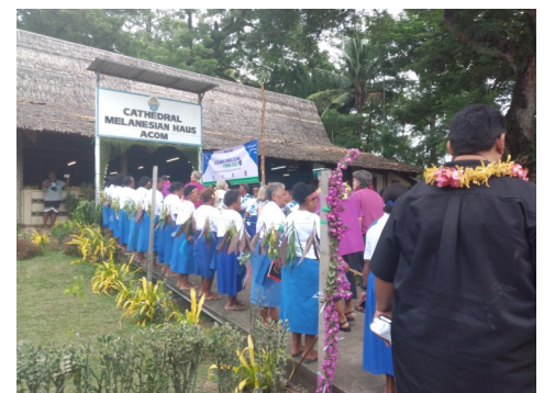
FONO members attending Breakfast after the opening service.