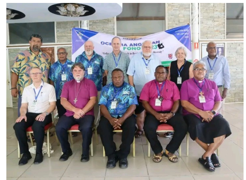
FONO Members.

Update